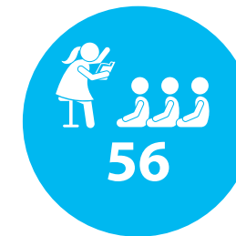
Summer Reading Challenge Starters