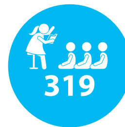
Summer Reading Challenge Starters