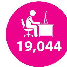
Public Computer Sessions