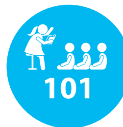
Summer Reading Challenge Starters