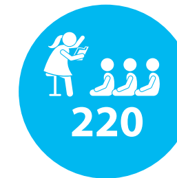
Summer Reading Challenge Starters