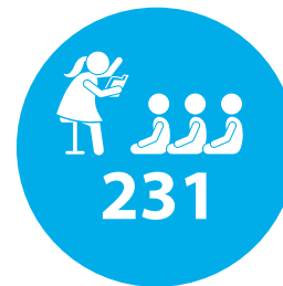
Summer Reading Challenge Starters