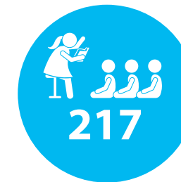
Summer Reading Challenge Starters