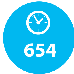
Opening Hours (Weekly)