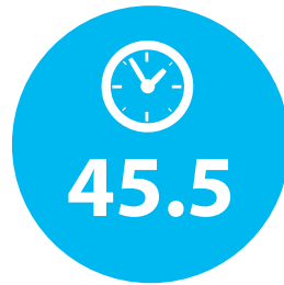
Opening Hours (Weekly)