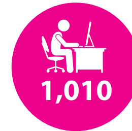
Public Computer Sessions